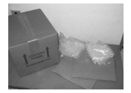
Figure 3: Final optimized box next to excess packaging

Implementation of the cleaner production process emerged from the operational need and shaped a link to CP. The process was carried out by an operator who would unwind the PVC tube and introduce it into a cutting device that activated a pneumatic knife. This activity was unproductive, generated employee's stress, and in some cases led to occupational illness,