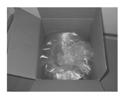
Figure 2: Internal view after reduction in

Raw material and in-process material stock areas were restricted and vertical, which makes in-process material flow and storage between phases more difficult. Plastic waste resulting from the production process was disposed of in common garbage, contributing towards pollution of the environment. The company had a production line with fifty types of products, all with their basic plastic composition, using flexible PVC tubes as their main raw material. It is supplied in rolls, packed in plastic bags and placed in a final undulated cardboard package (Figure 2). Figure 3 shows the result of the changes and the waste from excess packaging in the previous system.